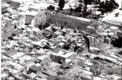
Figure 3: far right: The Old City of Jerusalem before the destruction of the Magharbeh Neighbourhood in 1967. After its destruction, the Buraq Plaza's dimensions were expanded from 3 meters wide and 22 meters high, to 70 meters wide and 60 meters high. The 2010 plan to expand the Buraq Plaza aims to remove the remaining relics of the Magharbeh Neighbourhood and to build a transportation station, elevators and museums underneath the Buraq Plaza and at the expense of historic relics, including Muslim relics.