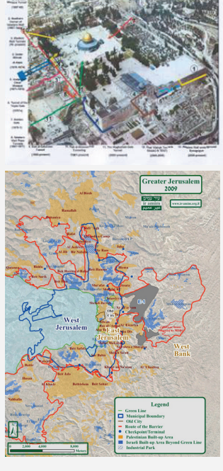
Figure 4: top : the tunnels that surround Al-Masjid Al-Aqsa and eat away at its edges. bottom : The Separation Wall that isolates Jerusalem.

8. The Separation Wall and preventing Jerusalemites and the 1948 Arabs from reaching Al-Masjid Al-Agsa: Ierusalemites and the 1948 Arabs expend great effort trying to be human shields that fill the vacuum and defend Al-Masiid Al-Agsa through various projects that aim to fill it with worshipers and enhance the Muslim Ummah's strong bond with their holy site2. Although all these efforts are valuable and support the Hashemite Restoration and patronage of Al-Masjid Al-Aqsa, Jerusalemites, the 1948 Arabs and the Jerusalem Awgaf Administration alone cannot contend with the Iudaization campaign and the religious tourism from all over the world that support and finance the building of synagogues and Talmudic schools in Ierusalem.