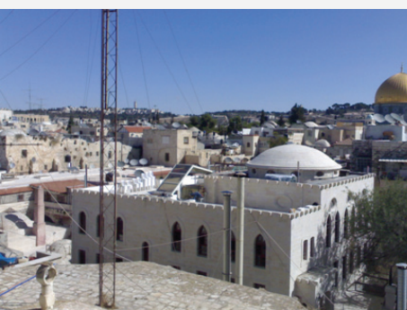
Figure 2: New synagogues above and below the ground: right : near Bab Al-Silsilah, the Ohel Yitzhak Synagogue, opened in 2009, has two above ground floors; through it visitors can go into the Western Wall Tunnels where settlers plan to open the largest underground synagogue in the world along the western wall of Al-Haram Al-Sharif; left : Umayyad palaces that might be transformed into synagogues along the southern wall of Al-Haram Al-Sharif.

the Umayyad Palaces south of Al-Haram Al-Sharif, beneath the Buraq Plaza, at the Sharaf Neighbourhood, the Western Wall Tunnels, Bab Al-Amoud (Solomon's Cave), Silwan (Ain Silwan), Bab Al-Khalil, Bab Al-Nabi Dawood, the Christian Quarter, Bab Al-Ghawanmeh, Bab Hittah, the Golden Gate and many other locations around Al-Haram Al-Sharif. Moreover, new Jewish settlements have been established in the environs of Al-Masjid Al-Aqsa such as the Har Hatzofim settlement in Ras Al-Amoud and settlements on the Mount of Olives. The Israeli occupation has also Judaized Islamic and Arab sites and relics under the guise of "restoration projects" which have changed inscriptions in the historic Islamic wall of Jerusalem.