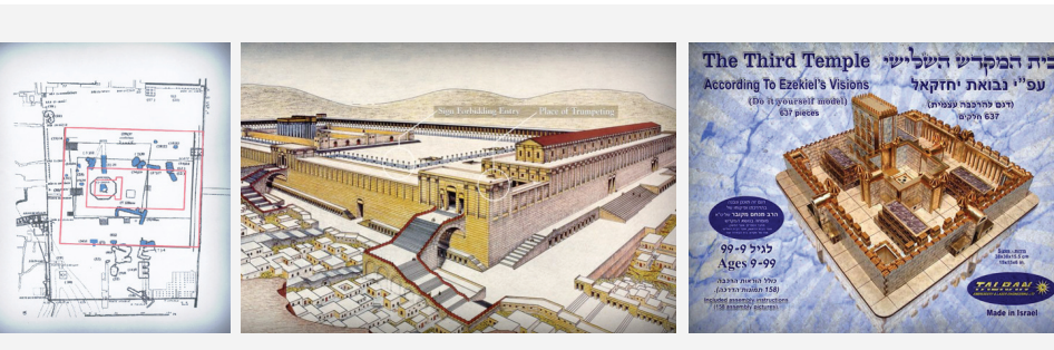
Figure 1: left : One of many theories locating of the so-called Jewish temple where the Dome of the Rock stands; centre : an envisaged recreation of the so-called Jewish temple; right : a projected image of the planned "Third Temple", models of which are sold in touristic centres and shops to gradually create acceptance in people's minds that the "Third Temple" should be built in place of Al-Haram Al-Sharif.

between the period 1993-2000, this strategy has succeeded in preventing Palestinian Muslims from reaching Al-Masjid Al-Agsa. Sharon's plan also led to over 1,500-2,000 acts of assault and aggression against Al-Haram Al-Sharif up until the time of this writing (2012). This Judaizing strategy has also led over 50 thousand settlers and almost 2 million non-Muslim tourists to enter Al-Masjid Al-Agsa without permission or coordination with the Muslim Awgaf since the year 2000. The settlers continue to support Mayor of Jerusalem Nir Barkat's ambition to have an annual number of 10 million tourists visiting Jerusalem and listening to Jewish tour guides who refer to Al-Haram Al-Sharif as the "Jewish temple". The Jerusalem Municipality also coordinates with hundreds of Iewish organizations around the world in order to fulfill this goal. Since the year 2000, tens of settler organizations, supported by the occupation's official institutions, have established tens of museums as part of the Iudaization campaign that aims to build a Jewish temple in place of Al-Masjid Al-Agsa.